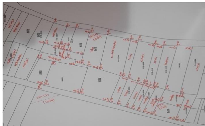
Figure 1. Illustration of Village PTSL product measurement

The validity score of the land area content on the cadastral map, compared to the area based on GU, is 0.077, indicating very low validity. If the r-table is referred to (with degrees of freedom = 30-2 and a significance level of 5%) of 0.3061, it can be observed that 0.187 < 0.3061 . This indicates that the land area listed on the cadastral map exhibits very low accuracy when compared to the area in the GU of Kalisari village. This very low validity is closely related to the methodology used for field measurements. The measurement methods used, which rely on terrestrial methods with measuring tape equipment and only consider the sides of the plane without considering the diagonals or conducting auxiliary measurements, result in incomplete data that cannot directly correspond to the information in the GU. The following Figure 1 is an example of GU where the majority of land parcels are only measured for their side distances.