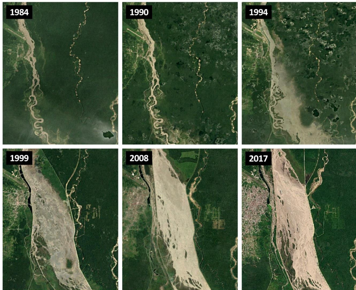
Figure 3. Landsat imagery showing ecological change in Kamoro land (1984-2017)

tribe, whose customary area is around the Ajkwa River, which was damaged due to the flow of mining tailings waste. This project began with constructing a new village east of the Ajkwa River which has now become a tailing approximately two kilometers wide. The Kamoro community of Nawaripi was then relocated to the new permanent settlement. Those who were previously dispersed to many taparu were then united in one permanent residence in the form of a village.